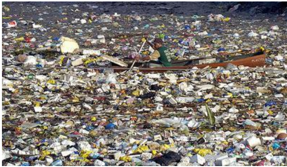
THE GREAT PACIFIC GARBAGE PATCH.